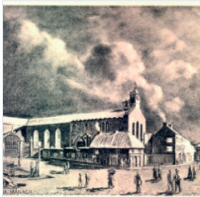
Duiske Abbey, Graiguenamanagh, County Kilkenny

The Kilkenny Digital Archive is an initiative of Kilkenny County Library and the ICT Department of Kilkenny County Council. This digital collection will give a flavour of the collections of images and memorabilia held by the library. In addition to this Kilkenny Library is working with local communities and organisations to both digitise and mount collections of local and national interest. The Graiguenamanagh Memories collection is such a project where Kilkenny Library has worked with the local community in partnership with Kilkenny Leader to collect and make images accessible to all. This archive aims to gather information and safeguard photos and images preserving it for future generations.