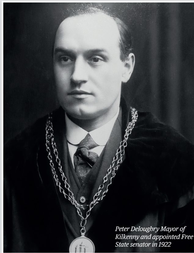
Peter Deloughry Mayor of Kilkenny and appointed Free State senator in 1922

A historic day in Kilkenny which was the scene of much rejoicing and celebration. The IRA - soon to be the Free State Army - took control of the military barracks, bastion of British rule in Kilkenny for over a century.