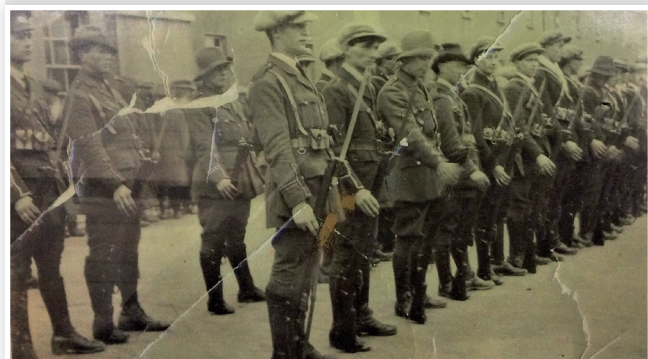
Military Barracks Taken on the afternoon of 7 Feb 1922 at KK military barracks - IRA stand attention.