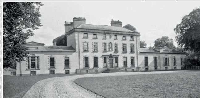
Woodstock House, Inistioge destroyed in July 1922

June 22' witnessed a historic election, the first general election to use the PR system. How did the general public vote in Kilkenny? In the running were Pro-Treaty and Anti-Treaty Sinn Fein candidates. Also involved were the Labour Party and the Farmers Party. Pictured above is Cathal Brugha in Mooncoin.