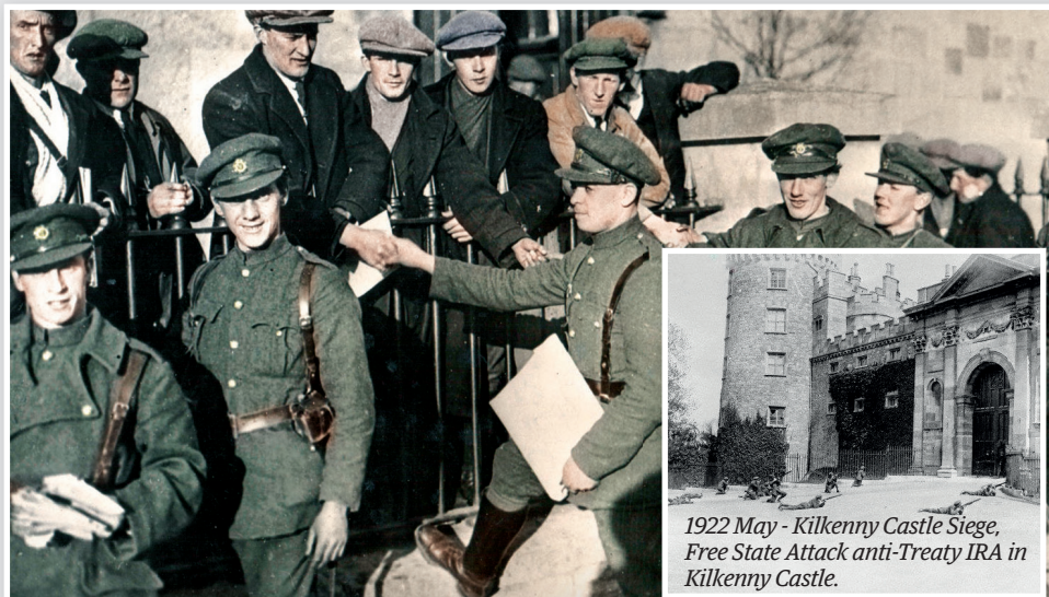
May 1922 - Free State soldiers shaking hands with their anti-Treaty foes just prior to the latter's release after a truce agreement.