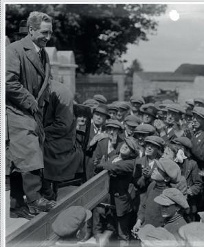
Cathal Brugha smiling in Mooncoin - canvassing for the Pact Election in June 1922.

During the early hours of a Tuesday morning in May 22', the anti-Treaty IRA amassed in Kilkenny City and proceeded to take over strategically important buildings. What followed was a full-scale attack on these positions by the Free State forces commanded by Commandant General Prout. Rifle bullets, grenade explosions and machine gun fire could be heard all around Kilkenny for two full days.