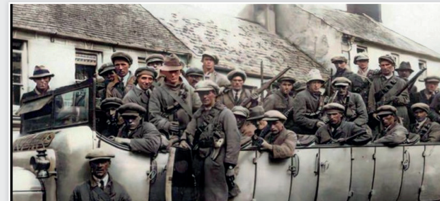
1922 July 16 - anti Treaty passing through Graigueenamanagh